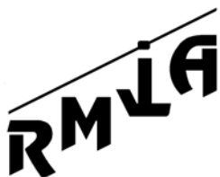
TABLE EXHIBIT SPACE CONTRACT